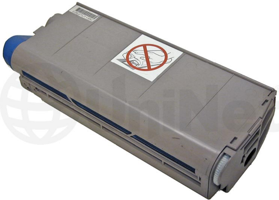
OKIDATA C7300 SERIES TONER CARTRIDGE