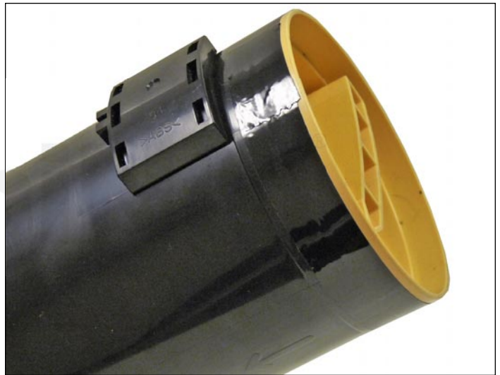
4. Replace the end cap. Replace the tape.