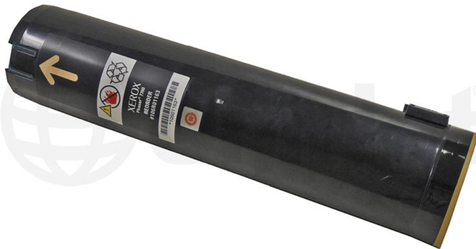
XEROX PHASER 7760 SERIES TONER CARTRIDGE