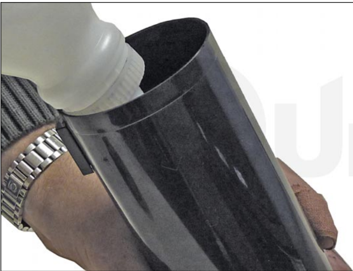
3. Vacuum the tube clean and fill with new toner for use in Phaser 7760.