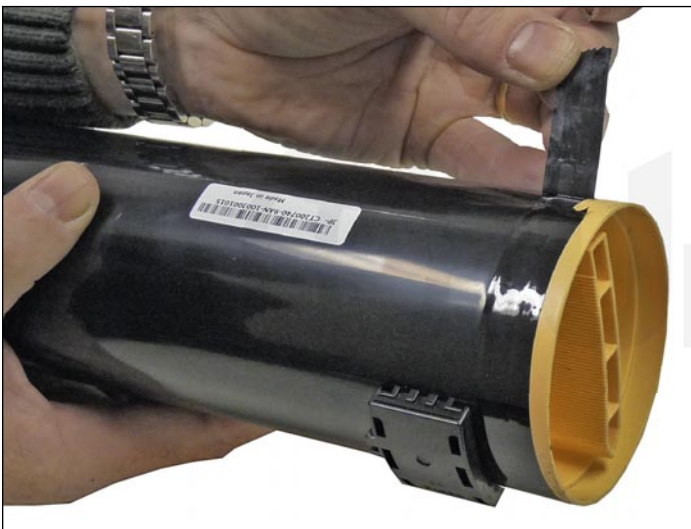
1. Remove the tape from the colored end cap.

The Phaser 7760 cartridges are rated for 32,000 pages Black and 25,000 Color. The OEM numbers are 106R01163 Black, 106R01160 Cyan, 106R01161 Magenta, and 106R01162 Yellow. There is a chip that must be replaced every cycle.