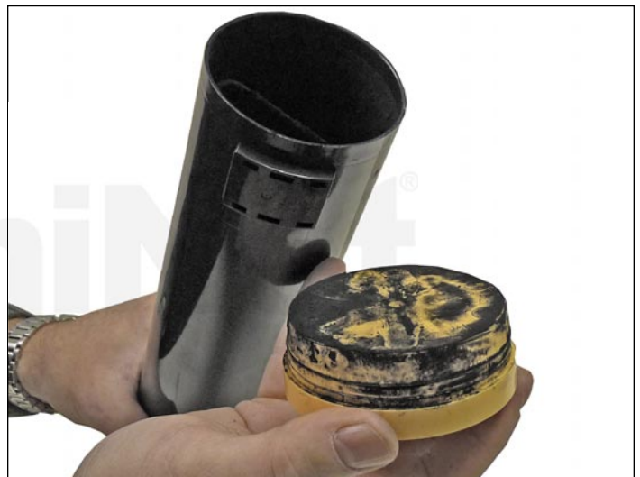
2. Remove the end cap.