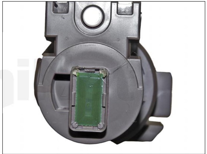
8. With a hot glue gun, place a small amount of glue on each of the corners that were removed.