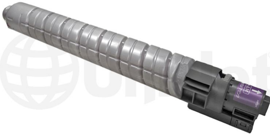
RICOH AFICIO C4500 TONER CARTRIDGE