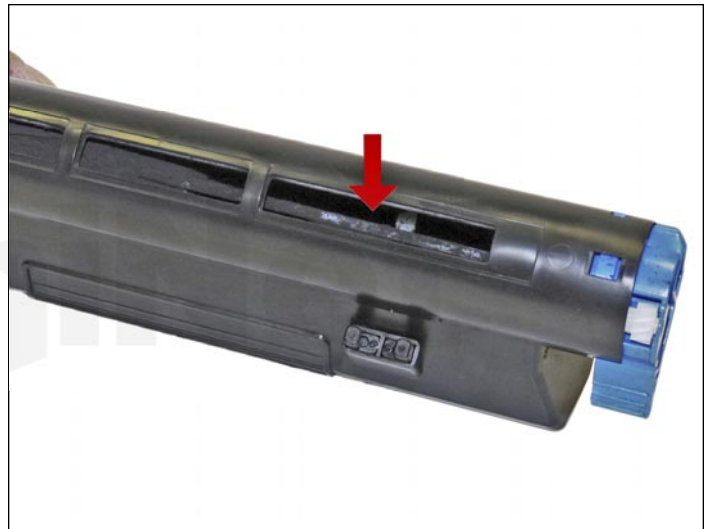
2. Turn the handle to open the toner port.