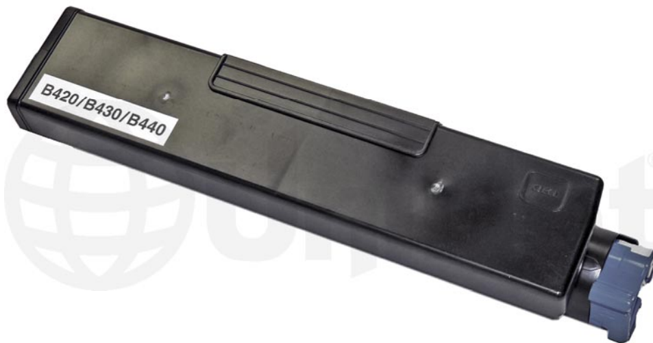
OKIDATA B420 TONER CARTRIDGE