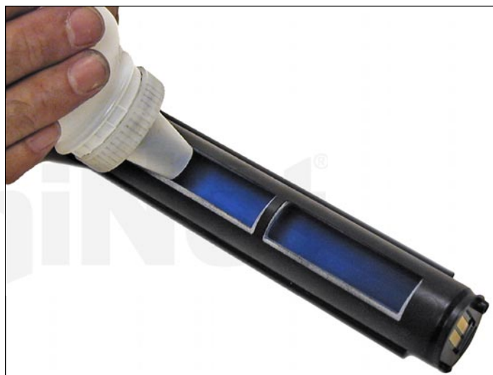
2. Fill the hopper with B2200 toner.