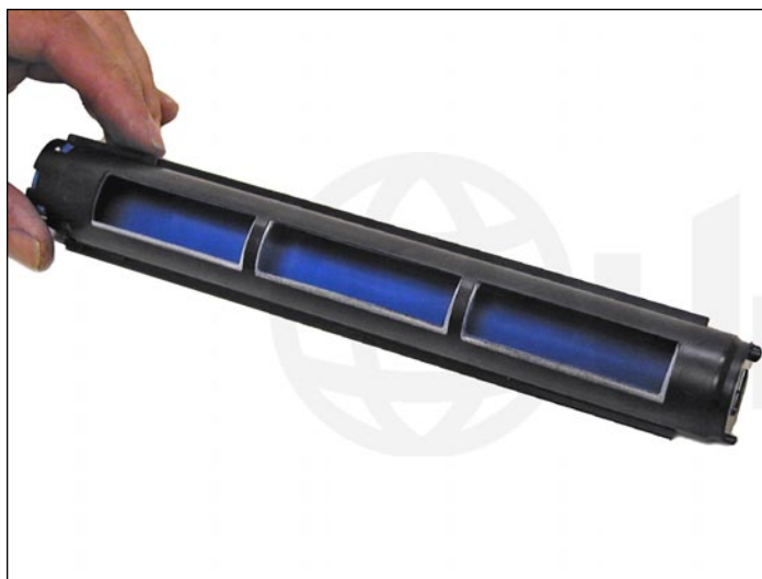
1. Turn the blue handle so that the toner port is open.

The Okidata B2200 toner cartridges are used in the B2200 and B2400 machines. They are rated for 2,000 pages at 5% coverage. There is a chip on the cartridge that must be replaced each cycle. The OEM cartridge part number is 4364030.