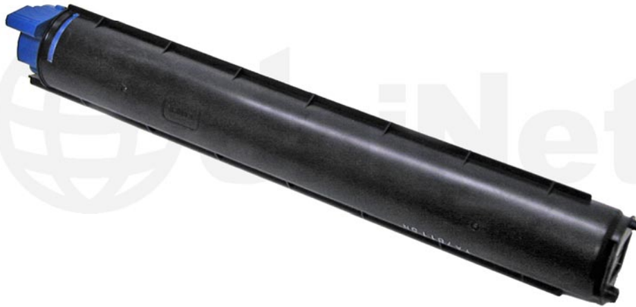
OKIDATA B2200 SERIES TONER CARTRIDGE