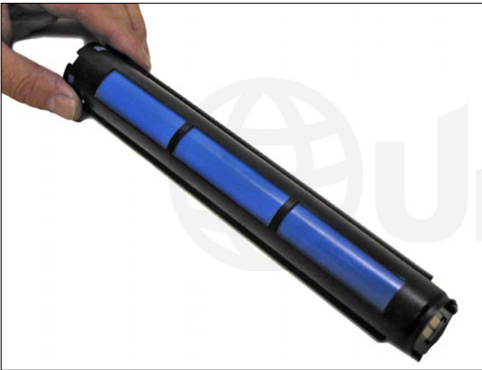
3. Carefully turn the blue handle so the toner port is closed.