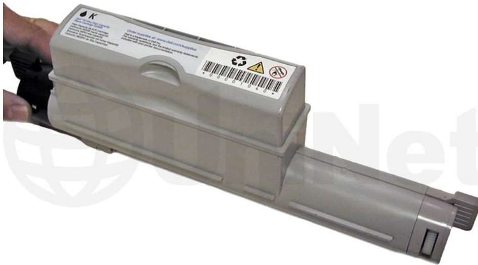
DELL 5110CN TONER CARTRIDGE

EASY TO REMANUFACTURE CARTRIDGE INSTRUCTIONS