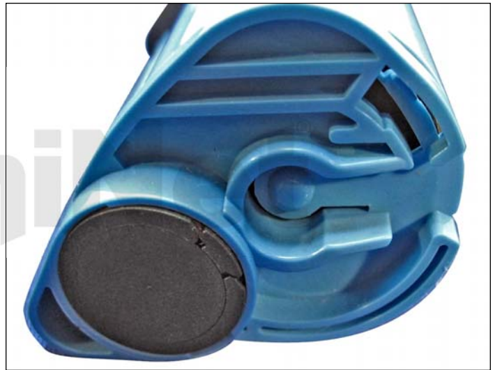
10. Replacement chip installed.