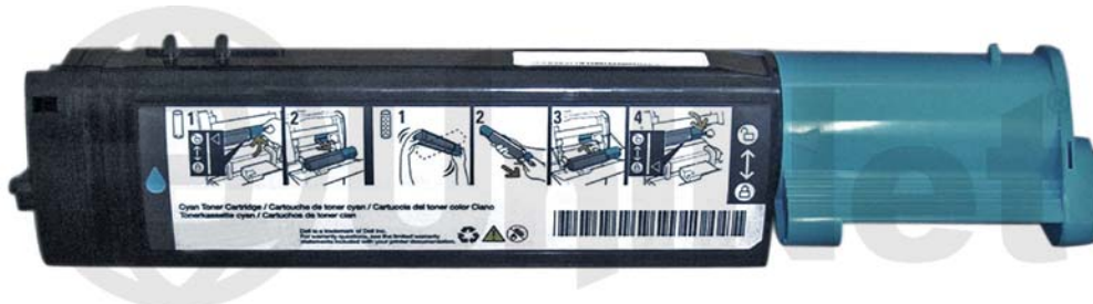
DELL 3000CN TONER CARTRIDGE