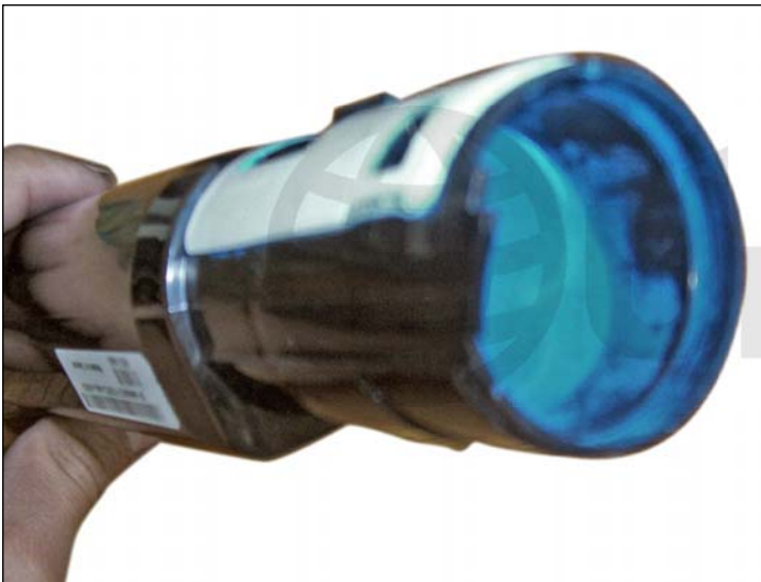
7. Shown is the waste carrier chamber. Empty it out and you will find the toner fill plug inside. Remove the plug and clean out the cartridge for refilling.

NOTE: You will need to mix toner and carrier in the same toner bottle before refilling the toner hopper.