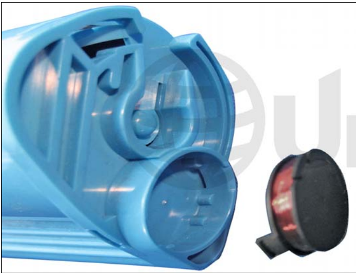
9. Make sure the replacement chip tabs enter the slots during insertion so that they lock in place.