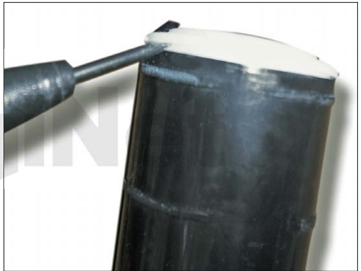
6. Remove the carrier fill plug as shown.