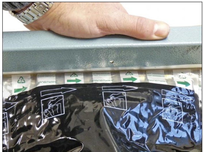
2. Heat seal the bag in the area indicated by the red line.

Do not use excessive heat. Just a short time interval works fine.