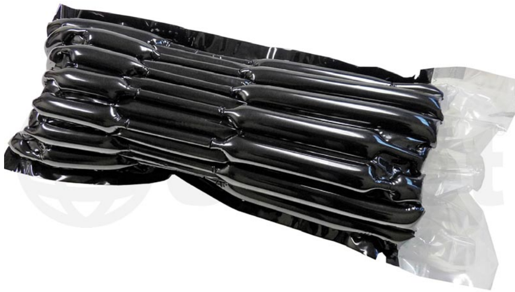
HEAT-SEALED TYPE INFLATABLE AIRBAG