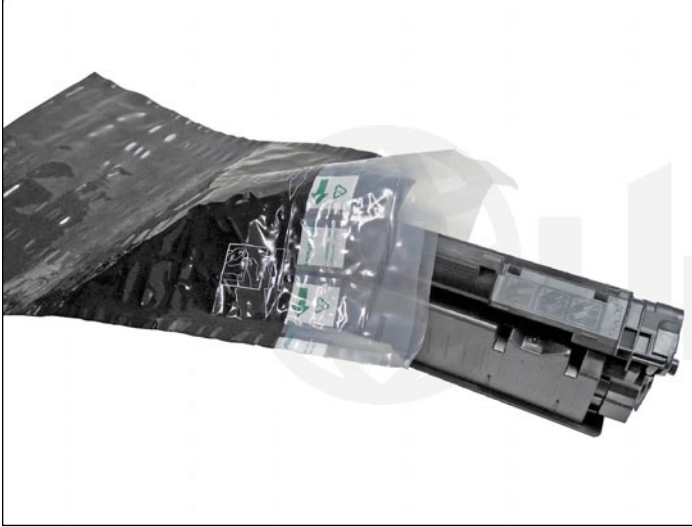
1. Place the cartridge in the correct size bag.